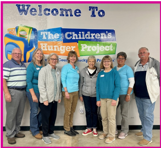
Our club joined three other D6 clubs to pack weekend food packages for The Children's Hunger Project. It was a fun evening of sisterhood, volunteerism, and community pride.