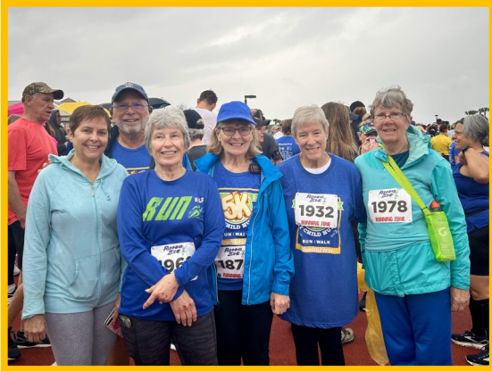
Four club members, one booster, and one future club member participated in a rainy and chilly End Hunger 5K benefiting The Children's Hunger Project.