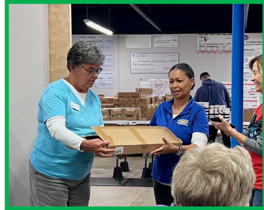
With a donation from a club member, our club was able to present a U.S. flag to The Children's Hunger Project for use in their board room. This will facilitate organizations, like ours, who use their meeting spaces to honor the flag.