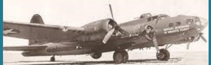
General Federation of Women's Clubs. A B-17F purchased and named for GFWC.

In addition to the Buy A Bomber campaign, State federations provided $234,834 in scholarships and $46,601 in loans to train nurses. The Federation recruited over 6,000 young women for the Cadet Nurse Corps. Over 4,500 Juniors enlisted in the various services established for women.